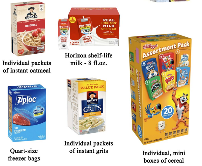
Individual packets of instant oatmeal