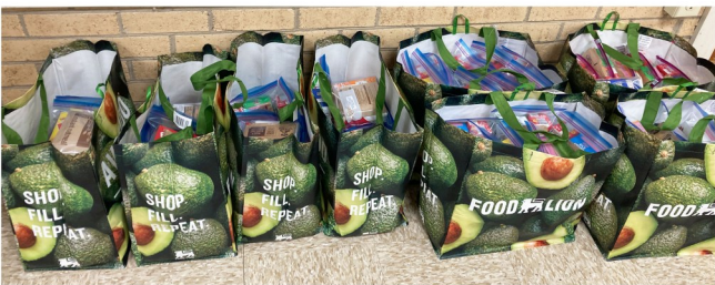
A total of 227 Breakfast Bags, weighing 199 Lbs., was donated to the CUOC Backpack Pals Program on December 9, 2024.

The CUOC Backpack Pals Program currently serves 479 kids each week during the school year and approximately 500 kids each week during the summer.