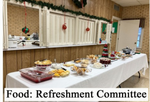
Food: Refreshment Committee