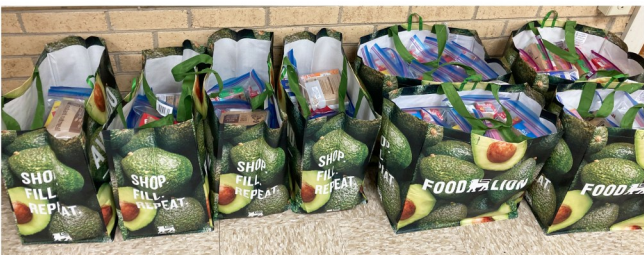
A total of 227 Breakfast Bags, weighing 199 Lbs., was donated to the CUOC Backpack Pals Program on December 9, 2024.

The CUOC Backpack Pals Program currently serves 479 kids each week during the school year and approximately 500 kids each week during the summer.