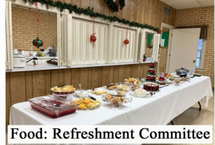
Food: Refreshment Committee