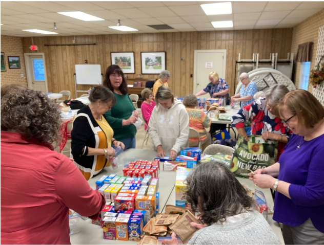
Breakfast Bags for CUOC Backpack Pals Program were assembled at the November 11, 2024 PW meeting.