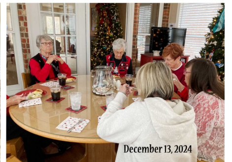
December 13, 2024